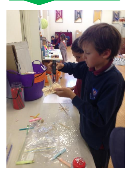
Will dressing up as a fairy ©