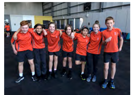
Caption: This week we have enjoyed a lunchtime Futsal competition in our school. Teams had to choose a country, this is Team Croatia. Clearly the World Cup excitement is still with us.